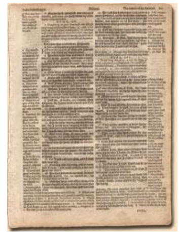
Geneva Bible (1560)