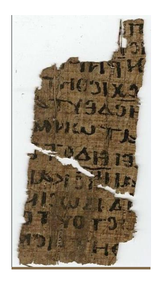
Early papyrus from John's Gospel

Canonicity took the following into account.