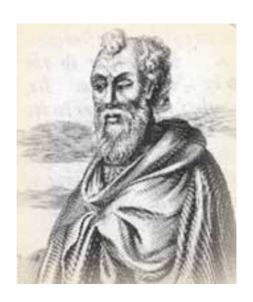
Clement (died 99) extensively quoted Paul's epistles verbatim

Some recent critics, such as Bart Ehrman, author of "Misquoting Jesus," have claimed that there are too many variants across these manuscripts to reconstruct the original with confidence. But this conclusion is too hasty - 80 percent of the variations are simply spelling errors that are easily accounted for. While there is a handful of minor texts upon which some New Testament scholars disagree, there is no textual variation that threatens any central Christian doctrine.